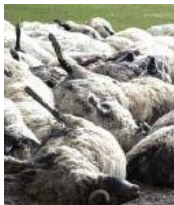
Image 3: After the slaughter